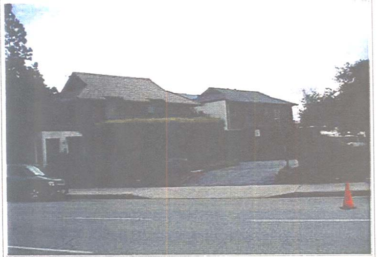
2 Rear Buildings

Appraisal: $ 1,385,000 Loan: 942,000 Loan to Value Ratio: 68.01%